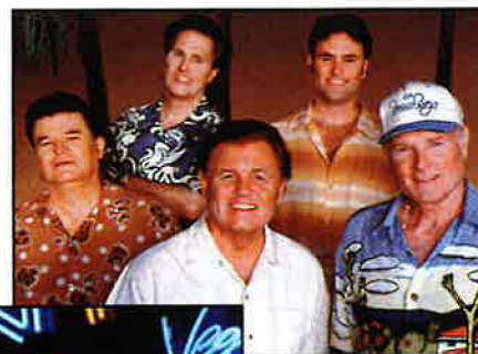
The Beach Boys