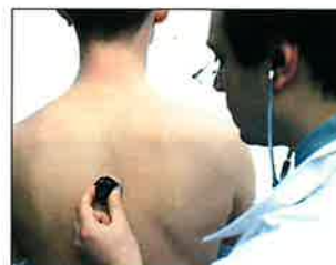
Solutions to Increase the Supply of Allergist/Immunologists 12