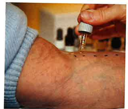
Growth of the U.S. population. An increase of 50 million people (18%) is expected between 2000 and 2020.