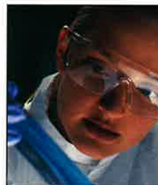
Distribution of Allergy and Immunology Training Programs by State 8