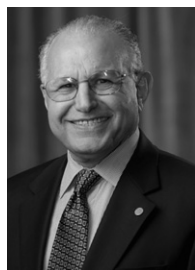
Figure 19. Sami L. Bahna, MD, DrPH

The presidential year of Sami L. Bahna, MD, DrPH (2009–2010) (Fig 19), witnessed the continuation of the ACAAI as a prominent national and international organization dedicated to education, collaboration, and advocacy. The College increased its membership by 5,708, representing 89 countries, increased its collaboration with the AAAAI in addressing practice issues and preparation of joint statements, and continued its support of the EAAACI.