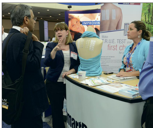
Innovations in allergy-immunology products and services were discussed at a variety of scientific exhibits.