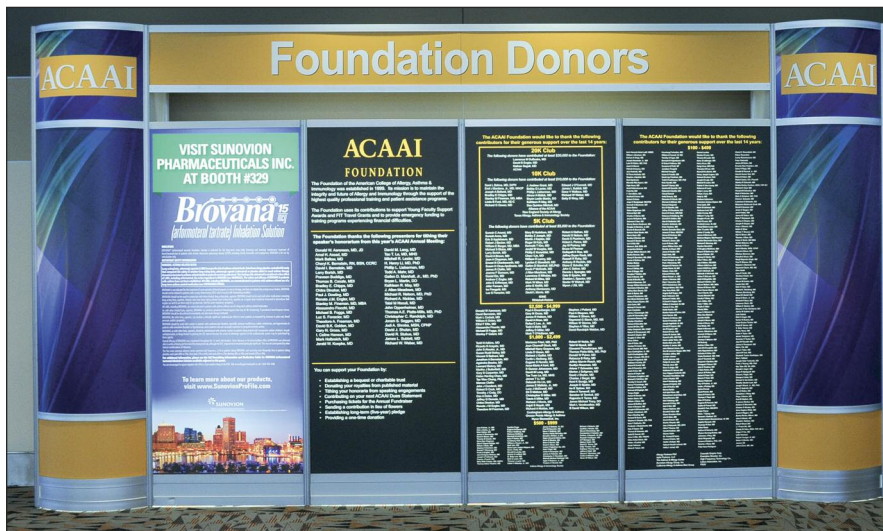
Donors who achieve 20K Club , 10K Club or 5K Club levels are acknowledged at each Annual Meeting with listings on the Foundation Honor Roll display, in the Convention Program Guide and with a special ribbon.

Gifts to the Foundation – which will be applied toward your 20K Club , 10K Club or 5K Club contribution goal – may be handled in a variety of ways, including cash donations, through a contribution of stock and charitable trusts/bequests. In times of bereavement, you can request donations be made in lieu of flowers – or easily establish a named memorial fund – to help advance the care of allergy and immunology. The Jean Chapman Endowment Fund for Education was established to help support fellows-in-training travel grants.