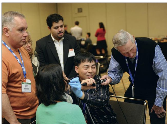
The "Hands-on-Session in Rhinology" (above) and "Skin biopsy: Procedure and Interpretation of the Report" (right) were two of the 33 workshops offered to attendees.