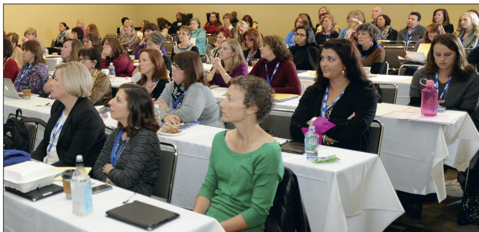
Over 100 attendees participated in the ACAAI Advanced Health Care Providers Course.

Plan to bring your professional staff to the allied health courses at the 2014 ACAAI Annual Meeting in Atlanta, Nov. 6-10. General session registration fees for participants are waived, allowing them to attend plenary sessions and symposia.