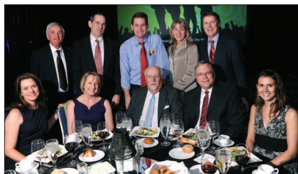
2012 Annual Fundraising Dinner